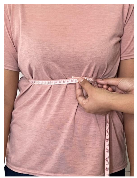
Figures 3 Pretest: Chest expansion