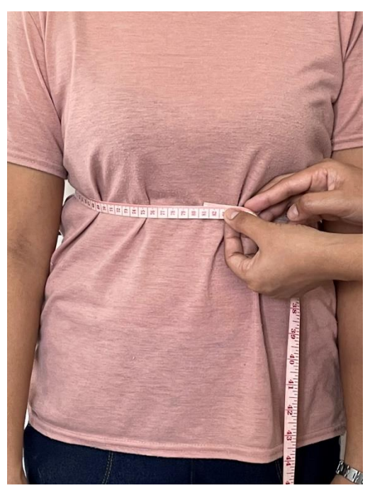
Figures 4 Posttest: Chest expansion